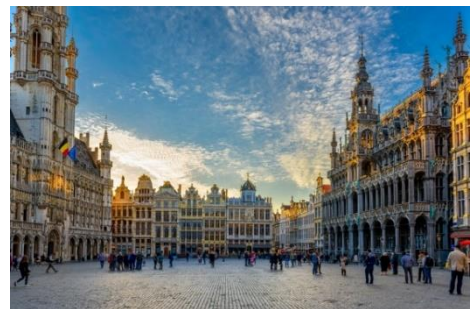
La Grand place of Brussels